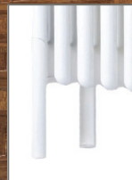
Optional insertable feet Available for all column radiators