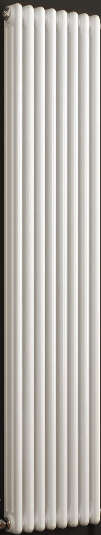
Image shown 3 column 1800 X 380 white